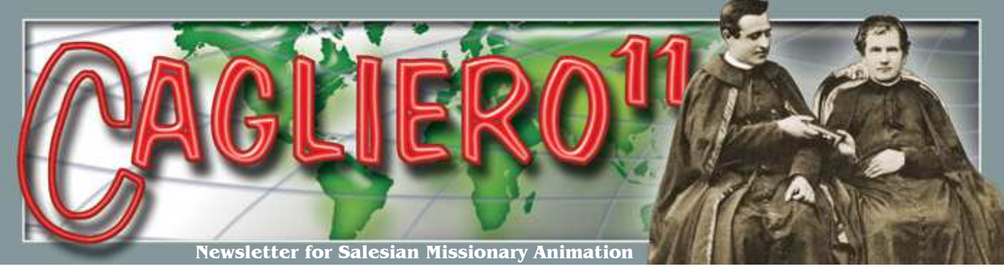
A Publication of the Mission Department for the Salesian Communities and Friends of the Salesian Mission

ear Salesians and friends of the Salesian mission,